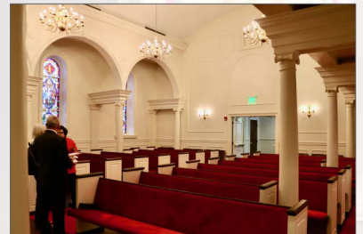
St. Andrew's Chapel