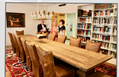
Oxford Conference Room