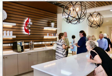
The new Welcome Center