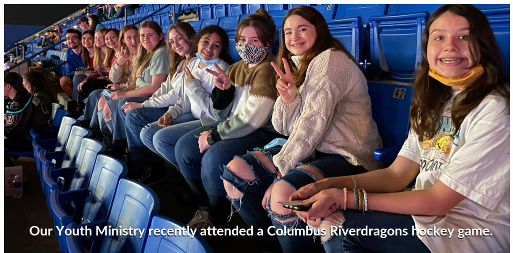
Our Youth Ministry recently attended a Columbus Riverdragons hockey game.