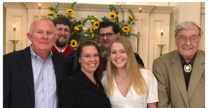
The Coggins Family